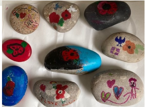
Made by our Sunday school children for Remembrance Day 2021.

Remembrance Service is on Sunday 13th November 2022.